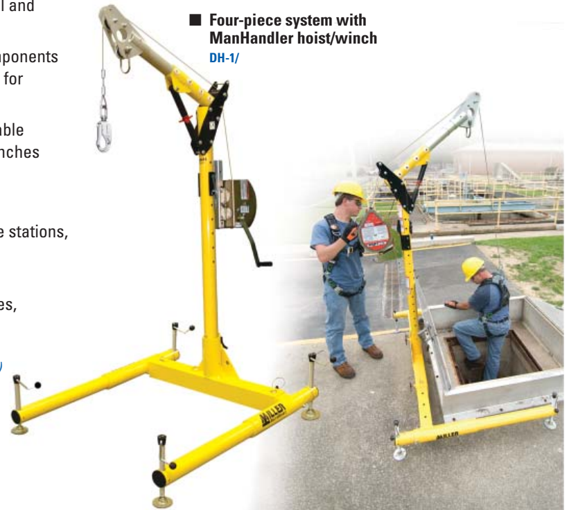
■ Four-piece system with ManHandler hoist/winch DH-1/