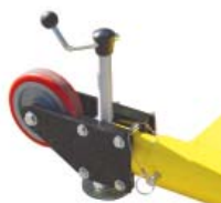
■ Wheel Kit for DuraHoist Three-Piece Base DH-4WK/