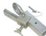
■ Pintle Hitch Adapter DH-15/