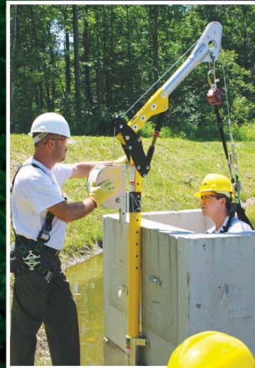
Portable Confined Space System