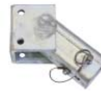
■ Single Direction Bumper Receiver DH-17/