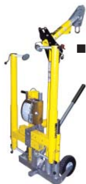
■ DuraHoist Equipment Cart DH-18/