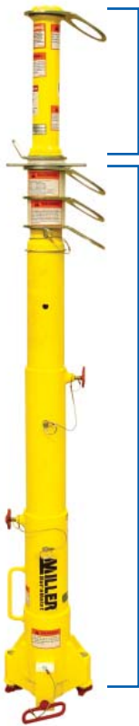
■ 14-in. (.36m) Extension Post DH-AP-2/

Provides option to tie-off one worker at an increased height of 68.5-in. (1.74m)