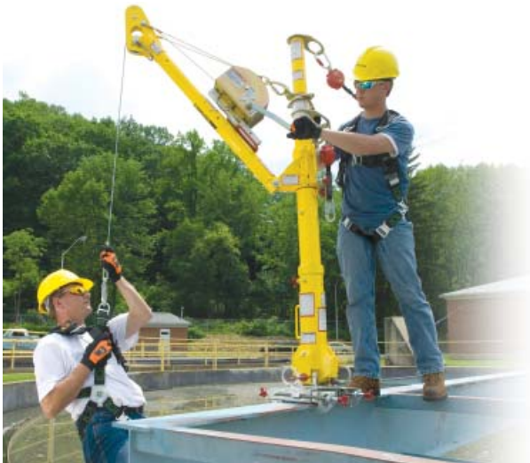
■ Rescue/Material Handling Davit Arm DH-AP-3/