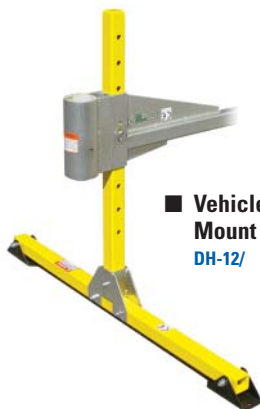
■ Vehicle Hitch Mount Sleeve DH-12/

Designed to install into a 2-in. (.05m) receiver on an attendant vehicle to provide a portable anchor point for confined space entry/retrieval, rescue and fall arrest applications.