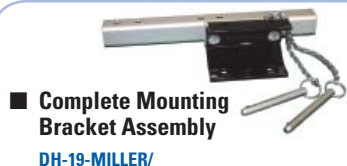
■ Complete Mounting Bracket Assembly DH-19-MILLER/

This bracket assembly is required to mount a Miller ManHandler® Hoist/Winch or a Miller MightEvac® SRL to the DuraHoist Portable Confined Space System