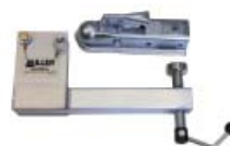
■ 2-in. (.05m) Ball Hitch Adapter DH-16/